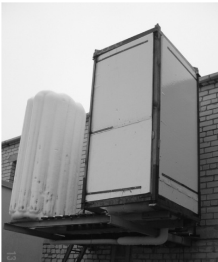
Fig. 3. Evaporator of the heat pump covered with screens during the supply of warm air

During the use of heat pump it was kept track of operating regime. Making the analysis of the switching on/off of the compressor, it is operational cycle depending on set up of back-flaw water temperature from 36 °C to 38 °C duration of the operation of compressor during the cycle becomes longer (Table 3). The same situation appears when outside air temperature declines until heat pump starts operating in uninterrupted regime without switching off. From the point of view of exploitation of heat pump it is preferable that durations and interruptions of the cycle would be longer. Mentioned above conditions contributes to defrost of the evaporator during the interruption of operation of the compressor at sufficiently high outside air temperatures.