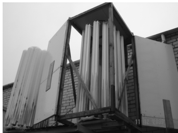
Fig. 4. Covering screens are opened. Plates of the evaporator almost thawed

Important assessment tool of evaluation of the heat pump are costs of the fuel. At the particular object liquefied gas is used as fuel (predominant propane). During the summer period, when power of heat pump is sufficient without operation of electric boiler, difference in costs of energy sources (electric energy – liquefied gas) reached 598 EUR or in average 150 EUR per month (Table 4). In July 2009, when energy demand was the lowest, difference in costs was only 94 EUR. During autumn period (2.25 months), when average outside air temperature was below +10 °C, for ensuring required