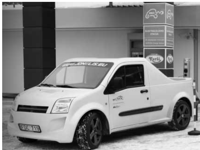
Fig. 1. Charging point at Brivibas street 299, Riga [9]

The first public charging point in Latvia was opened in October, 2010, at the petrol station "Kursi", Brivibas street 299, shown in Figure 1 [9]. It was developed by the local producer "Eltus" [10].