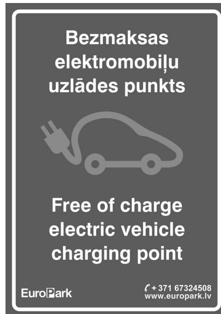
Fig. 2. Marking of charging point at Europark parking [11]

Currently, there are no agreements for unified marking of the charging points in Latvia. An example of marking at Europark parking is shown in Figure 2.