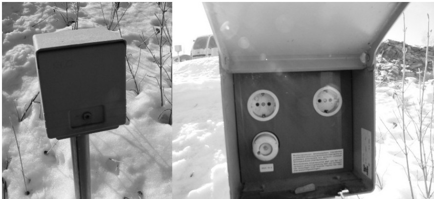
Fig. 5. Sockets for engine heating in town Nokia, Finland

The project launched electric charging point prototype and test unit development for electric and plug-in hybrid electric cars. After finishing the pilot project in 2011, the manufacturer is now starting serial production of the charging points [10].