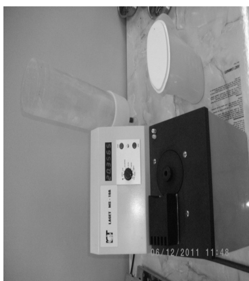
Fig. 1. Calorimeter LAGET MS – 10A

The heating value (calorific value) of the plant material in the study was determined in accordance with the standard ISO 1928:2009 Solid mineral fuels – Determination of gross calorific value by the bomb calorimetric method and calculation of net calorific value by complete combustion of the material in the calorimeter LAGET MS-10A in the Laboratory of Biofuels, State Agrarian University of Moldova (Fig. 1).