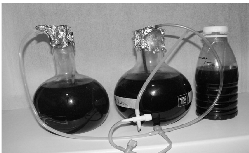
Fig. 1. Scenedesmus quadricauda cultivation

To provide experimental outdoor cultivation in Latvian climatic conditions the most suitable microalgae specie was determined from the species that already live in the territory of Latvia. As the most promising candidate Scenedesmus quadricauda L. was chosen. Scenedesmus quadricauda L. is the most common microalgae in Latvian waters, with the lipid content 18 % from dry biomass, biomass productivity 0.19 g·(L·day) -1 and lipid productivity 35 mg·(L·day) -1 [1]. Pure culture multiplication was performed before experimental microalgae cultivation in outdoor conditions (Fig. 1).