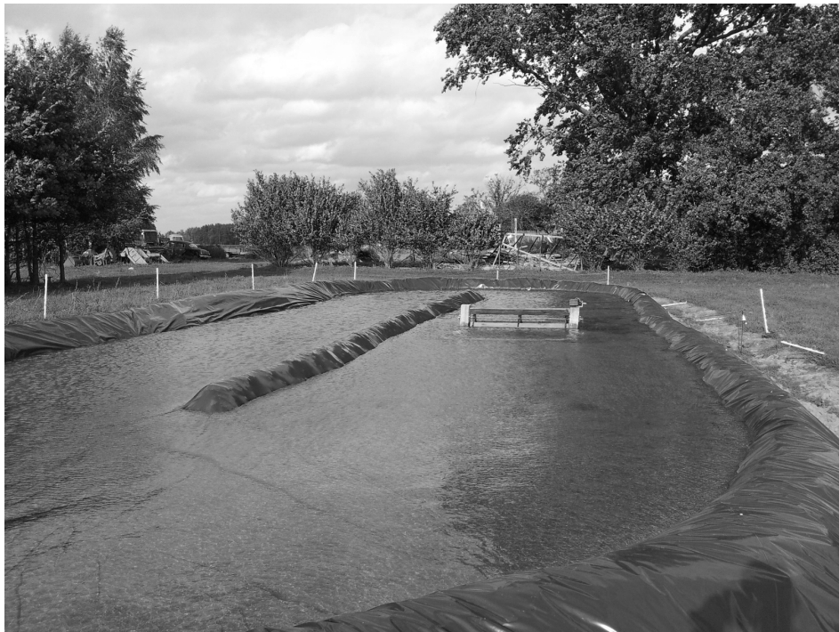
Fig. 3. Raceway pond with paddle wheel

The raceway pond was filled up with water from the nearby river filtrated through 1 \mu\text{m} filter to avoid from other microalgae species and possible predators. The cultivation media was prepared with nutrients and by adding 100 liters of high density microalgae substance.