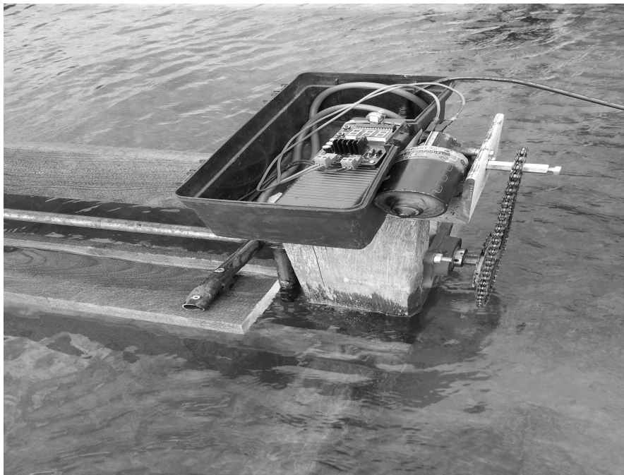
Fig. 4. Drive mechanism with regulation potentiometer

sedimentation and attaching to the plastic film. Attaching and sedimentation during night time was observed when mixing was provided only in day time.