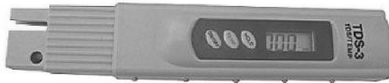
Fig. 2. Total dissolved solid meter TDS – 3

Scenedesmus quadricauda L. multiplication was made according to the green algae growth standard “LVS EN ISO 8692”. Media was made on distilled water base with adding the necessary amount of macro and micro nutrients. The lighting system needs to provide similar lightning conditions like in outdoor cultivation. To provide the light intensity similar to outdoor conditions “Sera” light bars were used. Artificial lightning provided 1.2 \pm 0.2 klx light intensity and optimal red – blue color light for the photosynthesis process. By help of electrical timers a strict lightning cycle was maintained – 16 hours light cycle and 8 hours dark cycle similar to the outdoor light cycle during summer in Latvia [3]. The flasks and containers were closed and bubbled from the air compressor “BOYU S – 1000A” and “RESUN AIR 4000” prevented microalgae from sedimentation. The supplied air was filtered through a 1 \mu\text{m} filter to prevent other microalgae and predators from entering the growth media. Measurement of total dissolved solids in stock solution was made with TDS – 3 meter (Fig. 2) and afterwards used to determinate when to add nutrients in the growth media.