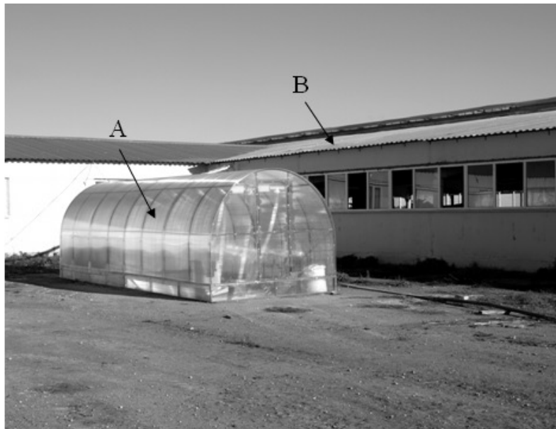
Fig. 1. General view of the pilot greenhouse (A) and the barn (B)

The factors under investigation were the pipeline depth ( h , mm), and perforation interval ( p , mm). To study the effect of these factors on the growth, development and yield of flower crops in the indoor growing facilities, a greenhouse with the dimensions of 8000x2800x3200 mm was manufactured and placed on the farm territory close to the barn (Fig.1). The greenhouse was equipped with high-pressure sodium arc lamps providing uniform illumination inside the chambers no less than 8000 lx for 14 hours. The illumination was controlled by a programmed timer ПИК-2.