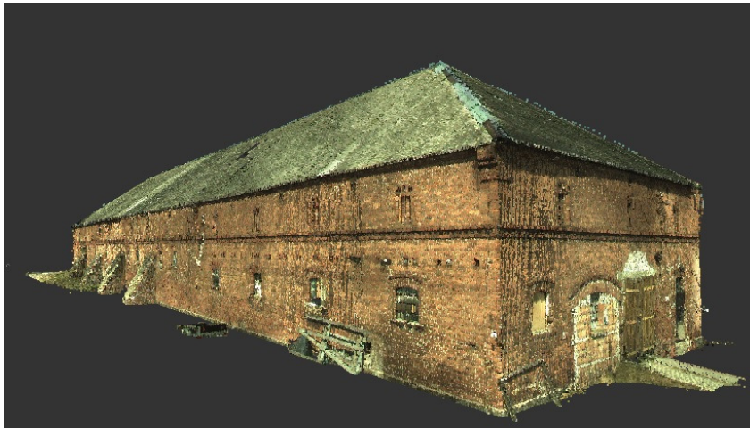
Fig. 1. Shape of a scanned building of barn – a cloud of points with a mapped texture

The model of a building obtained from 3D laser scanning is editable, for example, it can be used to generate floorplans and cross-sections. These can be useful when making a complete survey of a building. Floorplans and cross-sections can be created quickly using the Limit Box function, which generates a hexagonal box with cutting edges [7-9]. They can cut the model of a building at any place, creating a “slice” which can serve as a basis for making vertical or horizontal cross-sections of the building [8-10]. This is possible when we have measured straight and diagonal dimensions, diameters, lengths of arches, any angles, etc.